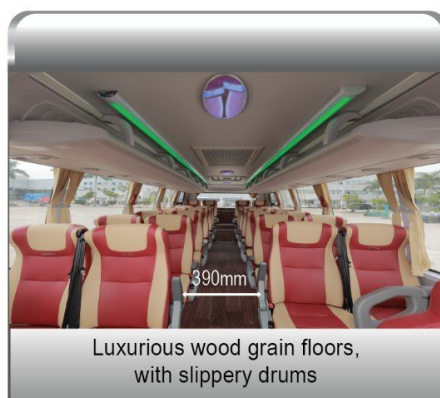
Luxurious wood grain floors, with slippery drums