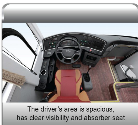
The driver's area is spacious, has clear visibility and absorber seat