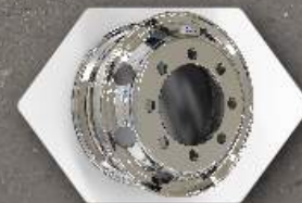
ALUMINUM ALLOY RIM Strong alloy rim aesthetically designed