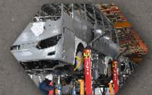
TC MOTOR VIETNAM Modern bus assembly plant meets national quality standards