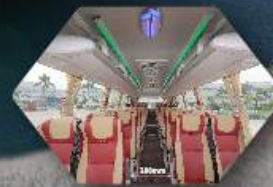
PASSENGER AREA (28 SEATER) Wide and luxurious passenger seats Spacious with 860mm legroom Wide aisle, luxurious wood grain floor with anti-slip features