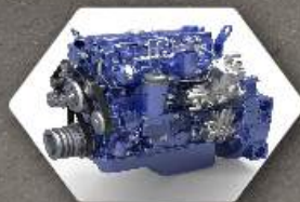
EURO 5 WEICHAH ENGINE A powerful and fuel-efficient Euro 5 engine