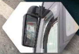
USEFUL SIDEVIEW MIRROR Designed to be anti-vibration with electric adjustment and defroster