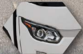
LIGHT SYSTEM Equipped with Halogen Projector light and integrated with daytime LED lights to help enhance visibility