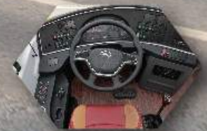
DRIVER FOCUS The driver area is spacious, has clear visibility and equipped with air suspension seat