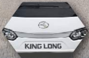
GRILLE Chrome King Long logo which is harmonious, modern and classy