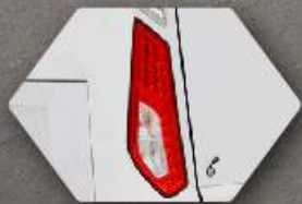
ATTRACTIVE REAR COMBINATION LIGHTS Integrated brake lights, turn signal and rear light